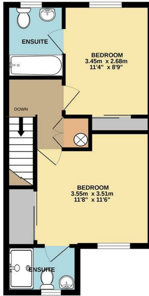
1ST FLOOR 36.2 sq.m. (390 sq.ft.) approx.